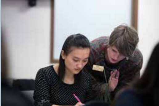
Small class size allows for individual attention