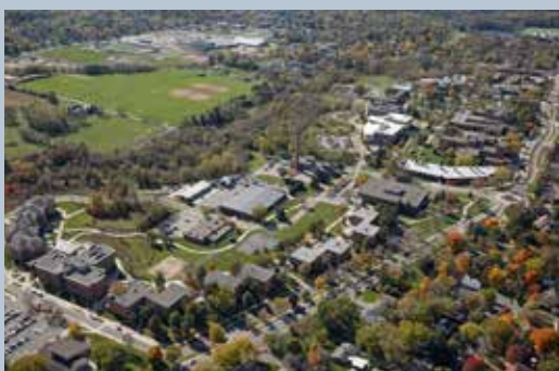
Bird's eye view of the UWRF Campus

At SSTC Institute, we believe in providing the best pathway for students to achieve their educational goals. This pathway is probably one of the fastest and most competitively priced pathway leading to a US business degree awarded by a university that has the highly sought after AACSB accreditation for its College of Business and Economics.