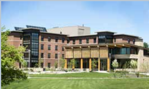
Jesse H Ames Suites - pod-style residence hall