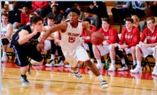
16 NCAA Division III varsity sports available